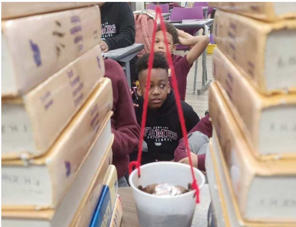
Each day scholars learned through a scientific object lesson. Our goal was to connect science and the Word.