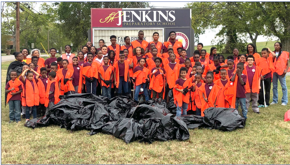
FHJ Students and staff took responsibility for their community by picking up many bags of trash from the area.